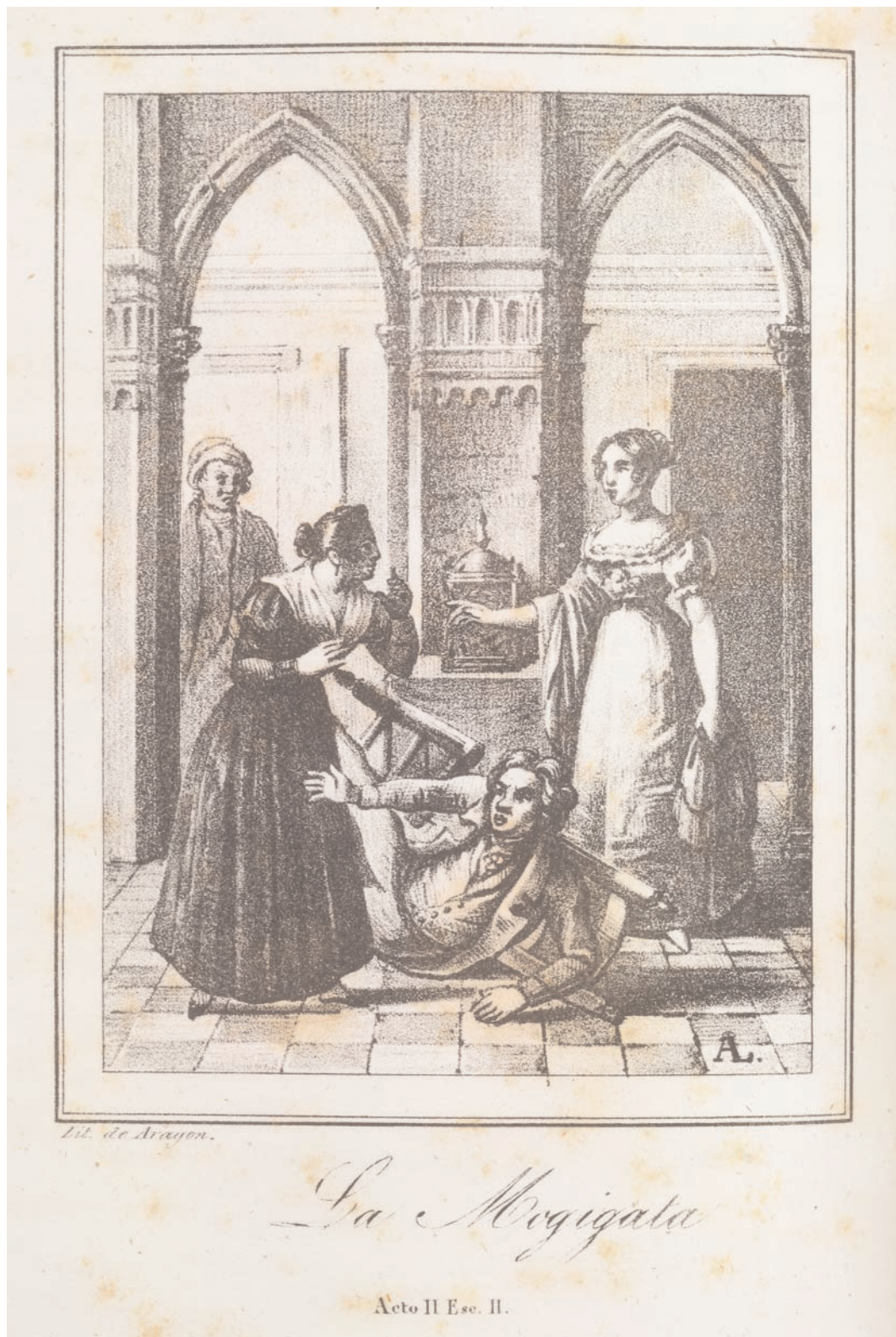
Fig. 5. Scene from La mogigata , act II, scene ii. Don Claudio trips over a chair during a secret assignation with Doña Clara and the lovers are discovered by Doña Inés and Doña Clara's father, D. Martín. Obras dramáticas y líricas de D. Leandro Fernández Moratín, entre los Arcades Inarco Celenio (Madrid, 1840), vol. ii, facing p. 5. BL, 1509/4495.