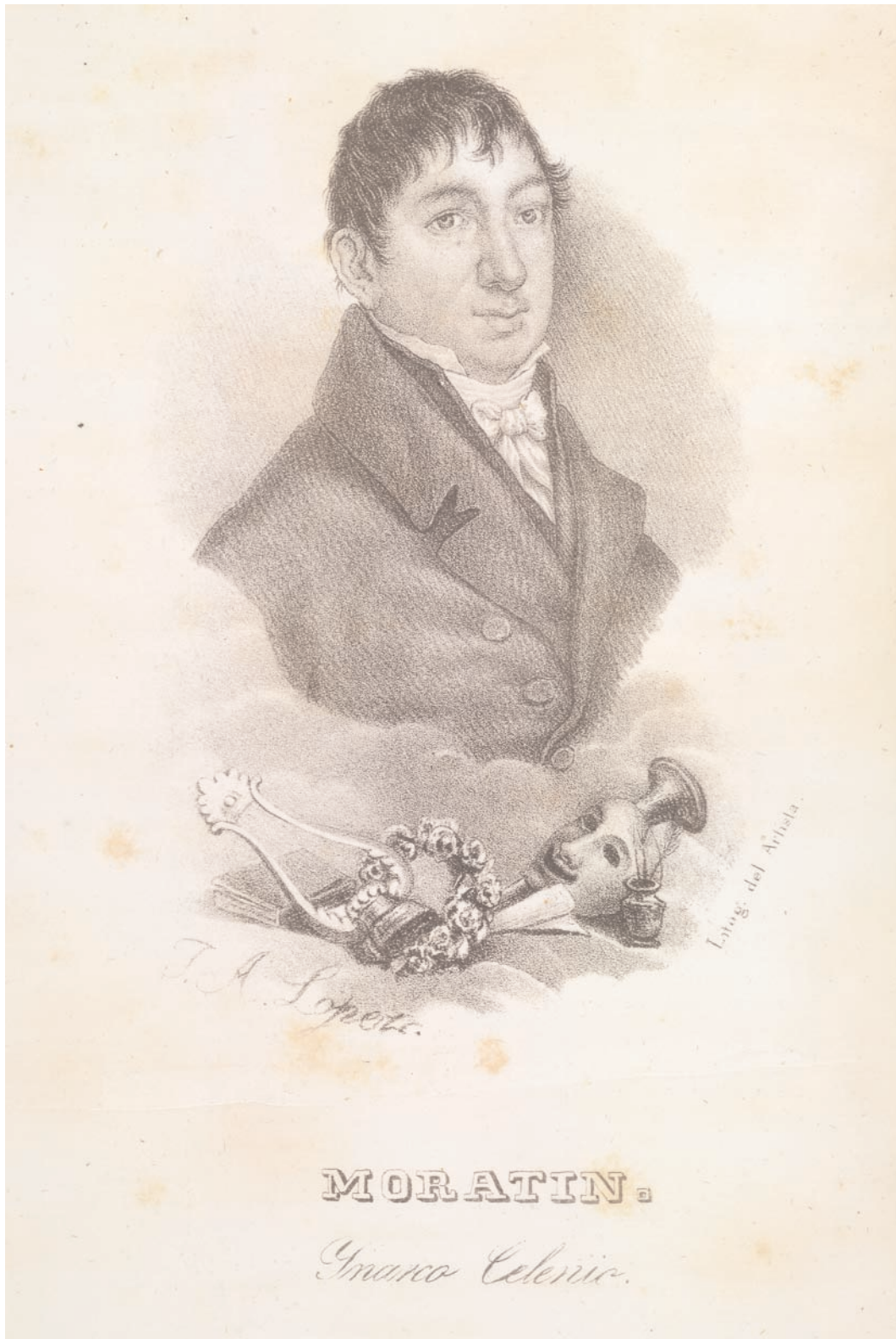
Fig. 7. Portrait of Moratín. Obras dramáticas y líricas de D. Leandro Fernández Moratín, entre los Arcades Inarco Celenio (Madrid, 1840), vol. iv, frontispiece. BL, 1509/4495.