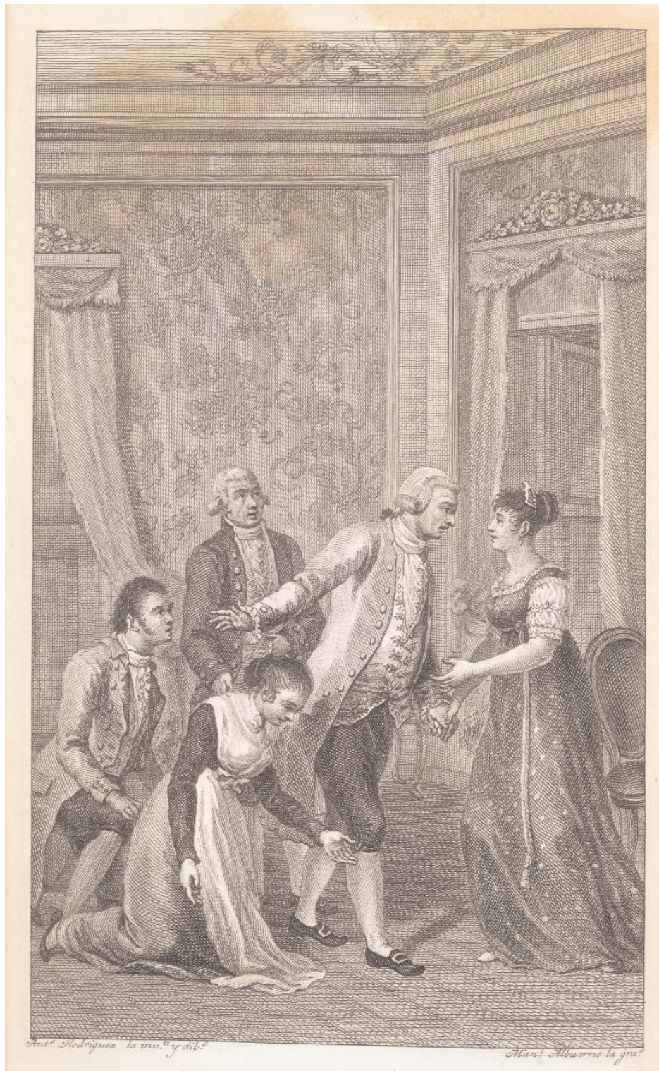
Fig. 6. Scene from La mogigata . In the final scene of the play, Doña Inés forgives the deceitful behaviour of her cousin, Doña Clara, witnessed by the latter's father, Don Martín. In an act of virtue and compassion that serves as an example to her cousin, she asks her father Don Luis for his permission to share half her fortune with Doña Clara and her future husband Don Claudio, both of whom kneel before her. Obras dramáticas y líricas de D. Leandro Fernández de Moratín, entre los Arcades de Roma Inarco Celenio (Paris, 1825), vol. ii, facing p. 7. BL, 640.f.23.