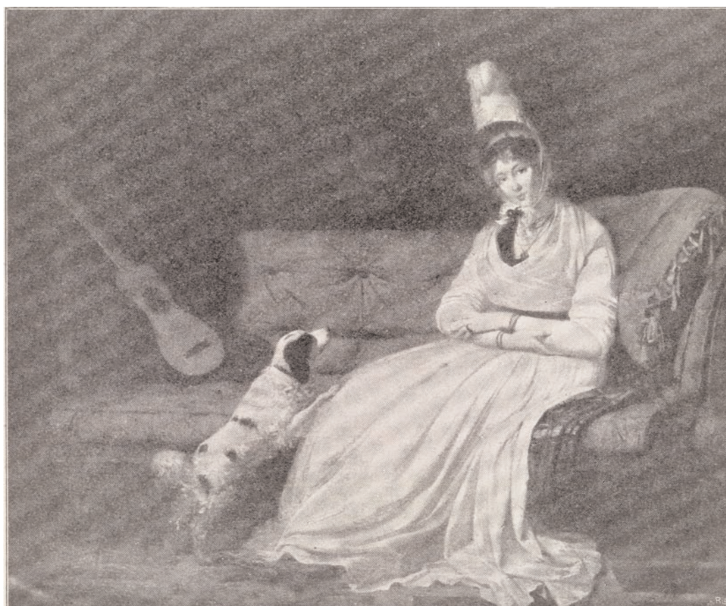
Fig. 4. Portrait of Lady Holland, painted in Florence in 1793 by L. Gauffier.

The manuscript of the journal covering her sojourns in Spain, Add. MSS. 51930-51937, forms part of the full manuscripts of her journal, which she wrote from 1791 to 1814. 20 These journals offer us a fascinating and extremely valuable account of her life and times. Given her prominent position as the wife of Henry Vassall Fox, nephew of the great Charles James Fox, her detailed records of conversations, events, dinner guests, gossip and the many other experiences that formed part of her daily life reveal much of the intimate workings of the party and of the lives of many other key figures from this time, as well as offering insights into the everyday concerns and interests of an intelligent and educated woman who was also a wife and mother. The journal containing the references to Moratín is Add. MS. 51931, a book of 115 folios measuring 258 mm by 200 mm, bound in marbled boards. The outside front cover has a handwritten label as follows: 'No. 5, from May 1803 to August 1804'.