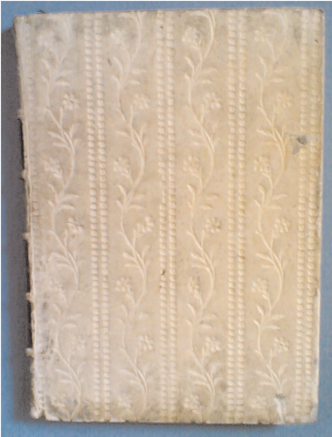
Fig. 3. Hook MS. M-1, cover.

In considering the significance of this newly-recovered manuscript and its place in the textual history of the play, this article will focus on two areas, beginning with textual comparison of several of the different extant manuscript versions and then looking at the significance of the Holland manuscript in casting new light on the play's early history and on the author's intentions.